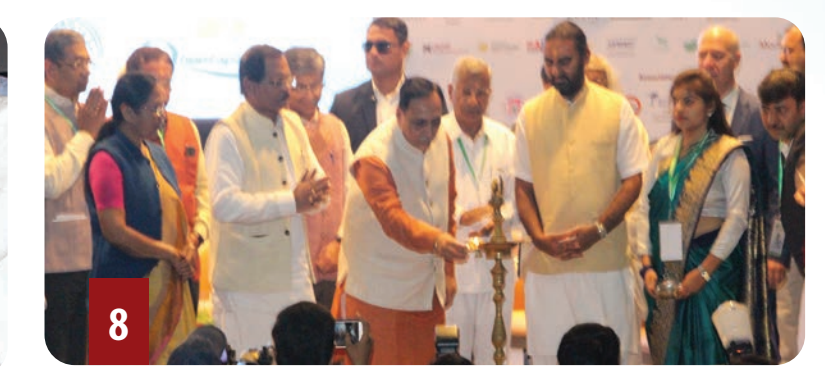
8th World Ayurveda Congress & Arogya Expo, 14–17 December 2018 - Ahmedabad Theme: Re-aligning the Focus on Health