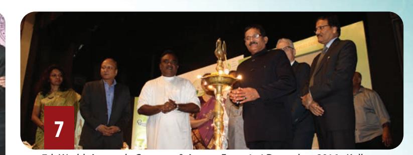
7th World Ayurveda Congress & Arogya Expo, 1–4 December, 2016 - Kolkata Theme: Strengthening the Ayurveda Eco Systems