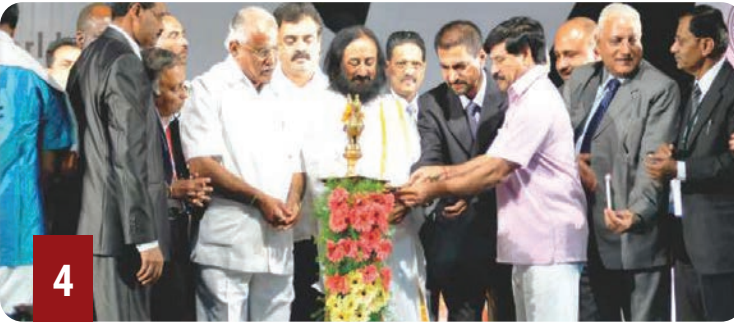
4th World Ayurveda Congress & Arogya Expo, 9–13 December 2010 - Bengaluru Theme: 'Ayurveda for all'

3rd World Ayurveda Congress & Arogya Expo, 16-21 December, 2008 Theme: 'Mainstreaming Ayurveda'