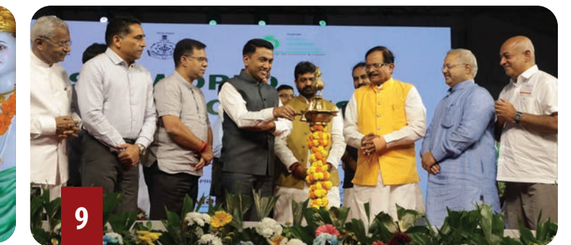
9th World Ayurveda Congress & Arogya Expo, 8–11 December 2022 - Goa Theme: Ayurveda for One Health