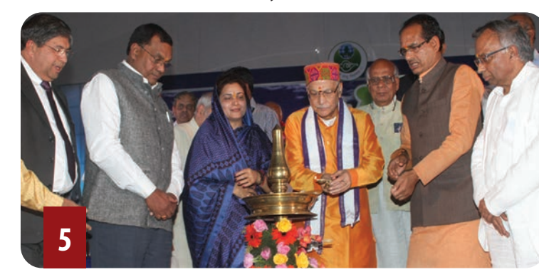
5th World Ayurveda Congress & Arogya Expo, 7–10 December, 2012 - Bhopal Theme: 'Enriching Public Health Through Ayurveda'