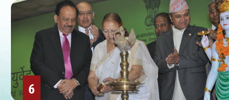
6th World Ayurveda Congress & Arogya Expo 6–9 November, 2014 - Delhi Theme: 'Health Challenges and Ayurveda'