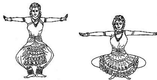
Fig 1: Posture depicting Ardhamandalam/ Aramandala

Symbolism- This posture symbolizes a sense of rootedness, stability, and connection to the earth. It is considered a strong and foundational stance, providing the dancer with a solid base from which to execute intricate footwork, body movements, and expressions.